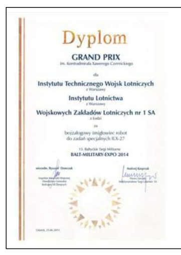
The Balt Military Expo 2014