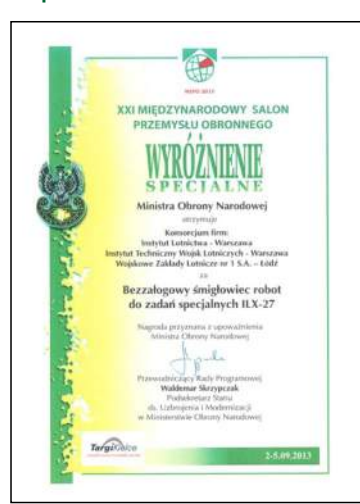
International Defence Industry Exhibition MSPO 2013 Kielce