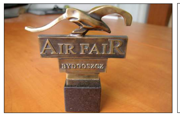
AirFair Exhibition 2014